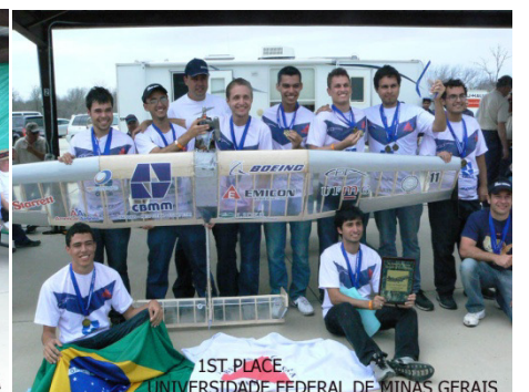
1ST PLACE UNIVERSIDADE FEDERAL DE MINAS GERAIS