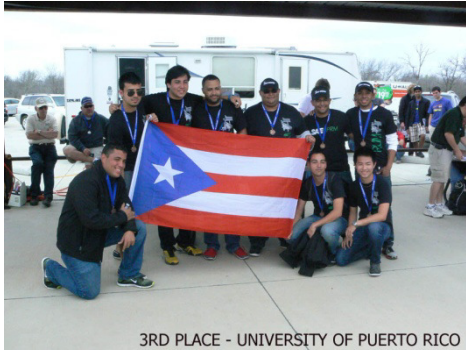
3RD PLACE - UNIVERSITY OF PUERTO RICO