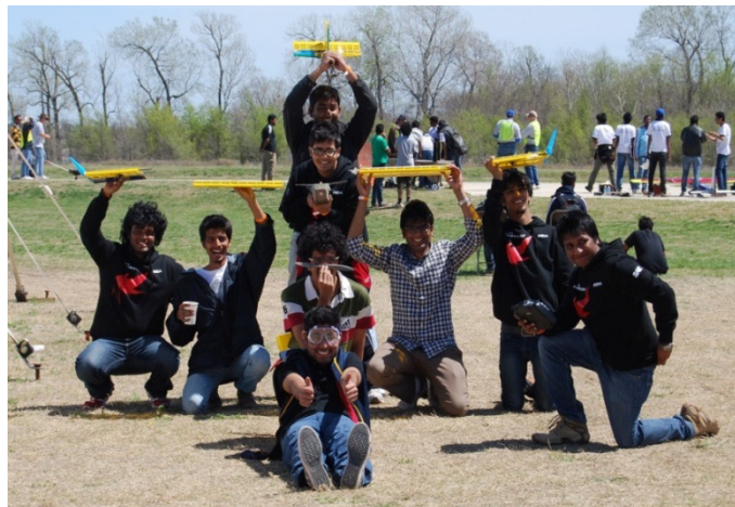
Team Pakistan (Honorable Mention)