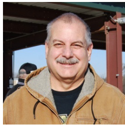
VP: Rob Lowe