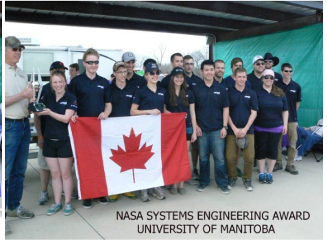
NASA SYSTEMS ENGINEERING AWARD UNIVERSITY OF MANITOBA