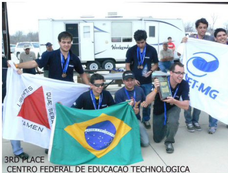
3RD PLACE CENTRO FEDERAL DE EDUCACAO TECNOLÓGICA