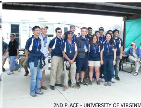
2ND PLACE - UNIVERSITY OF VIRGINIA