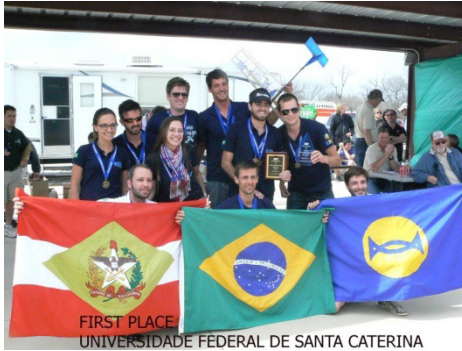
FIRST PLACE UNIVERSIDADE FEDERAL DE SANTA CATERINA